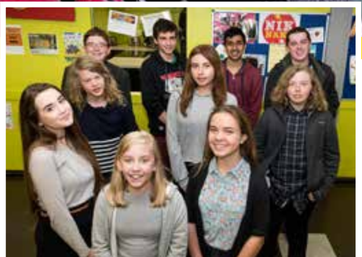
Some members of the East Sussex Youth Cabinet